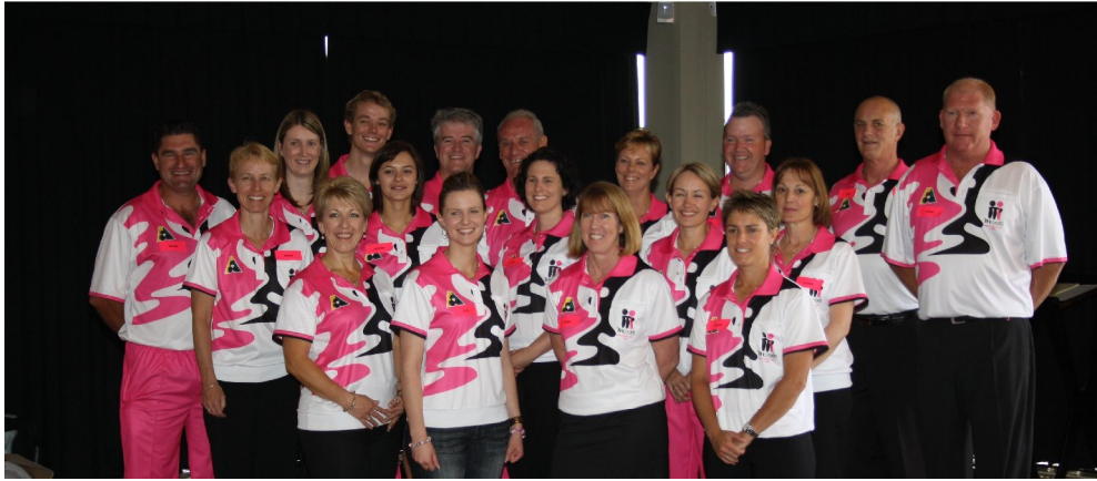
The BCiB Team supporting the 2009 National Pink Bowls Day

Before you renew your club insurance, please allow us the indulgence of providing you with the facts about BCiB